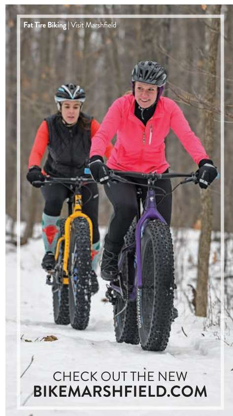
Fat Tire Biking | Visit Marshfield

This 37-acre city park can be accessed at the corner of Holly Avenue and the end of West 5th Street. It includes an asphalt trail between 5th Street and Adler Road, plus over 1.5 miles of natural surface trails. The park has a parking lot and a small nature pond.