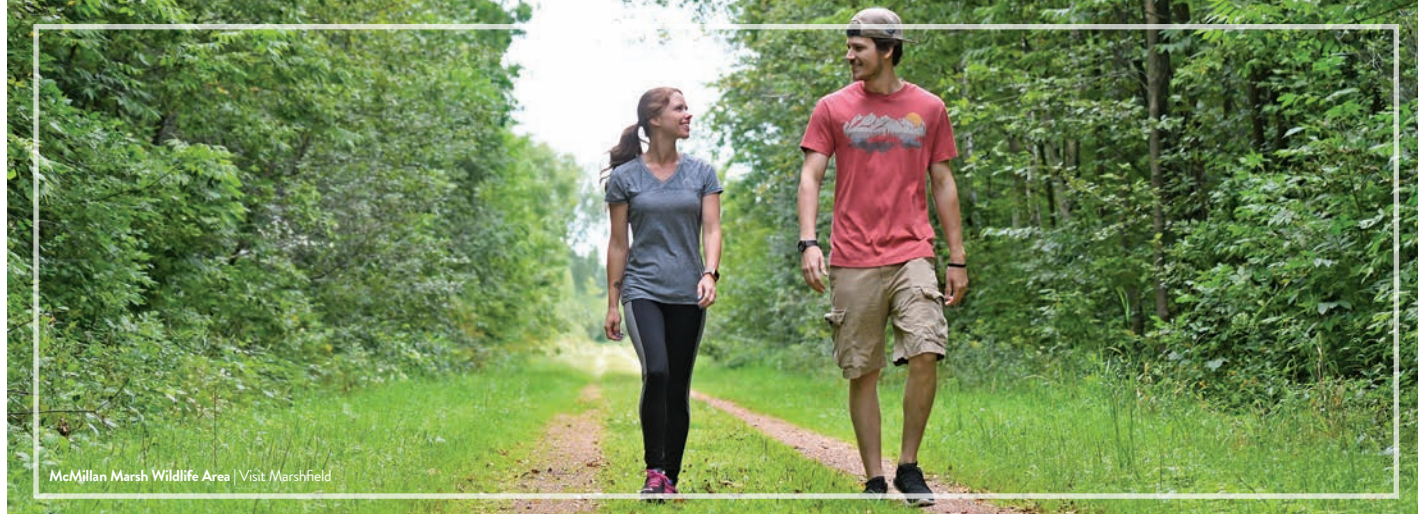
McMillan Marsh Wildlife Area | Visit Marshfield